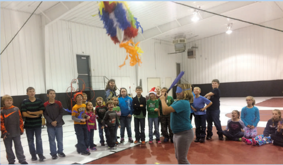
St. James Lutheran School students had a fun day of celebrating before Christmas break on Wednesday, December 21st. They went caroling around Northrop and also had a pinata that a student and his family brought to school to share their cultural traditions.