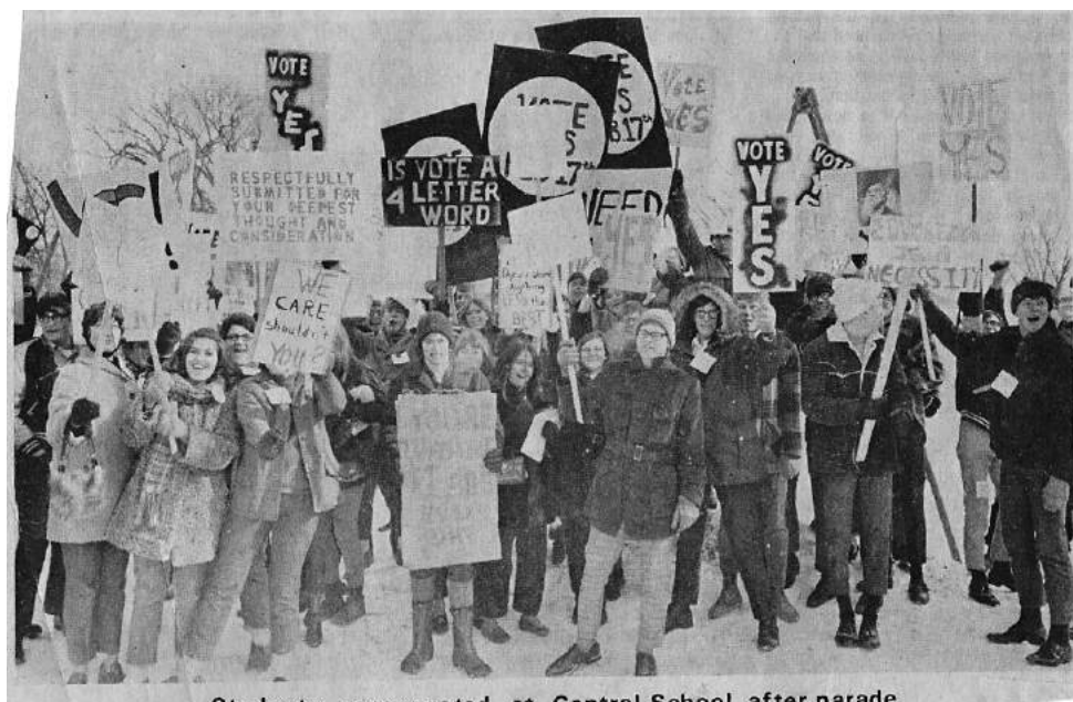
Students congregated at Central School after parade

The Regional Worship Center in Sherburn will host a pancake, eggs and coffee breakfast every Monday morning. They will start serving at 7:00 a.m. and continuing until 9:00 a.m. Free will donation.