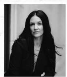
NEW BOOK BY DANIELE FREITAG