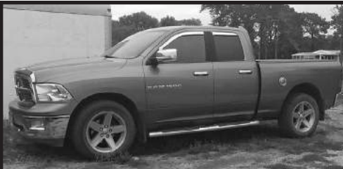
2011 DODGE RAM 1500 Quad cab, 4x4, option loaded, sale price $10,995 Welcome Motor Co., 1310 N. State St., Fairmont, MN, 235-3447, welcomemotorcompany.com

1 week, your picture and 20 words for $17; Run 2 weeks, your picture and 20 words for $27. We'll take the picture at the Photo Press for an additional $3.50