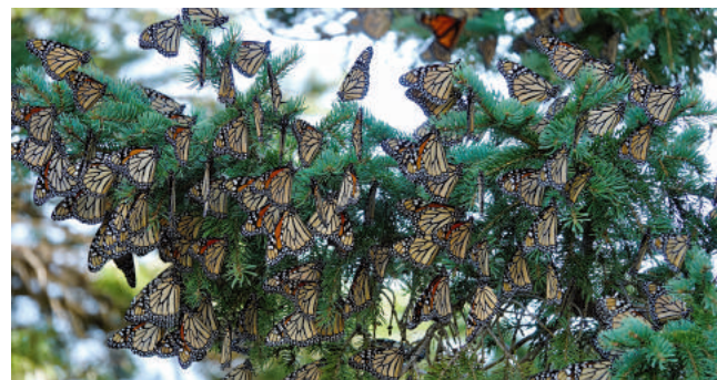
A roost of monarch butterflies.

Thanks for stopping by "In the end, we'll all become stories." -- Margaret Atwood